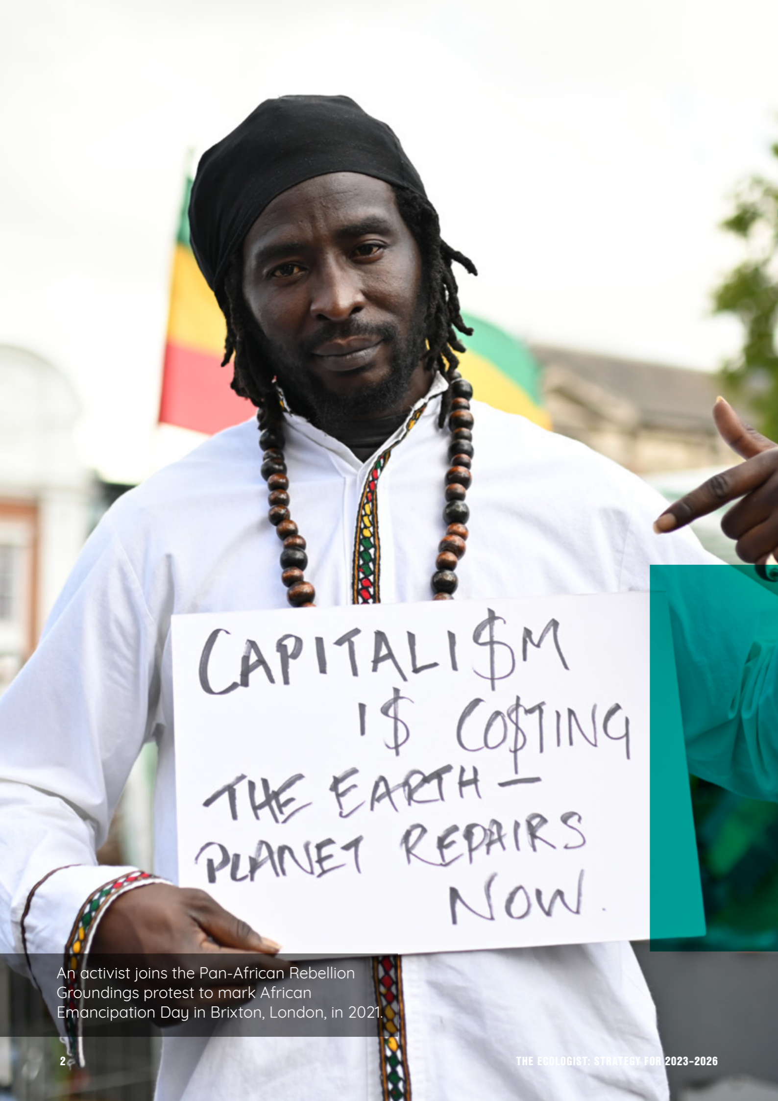
An activist joins the Pan-African Rebellion Groundings protest to mark African Emancipation Day in Brixton, London, in 2021.